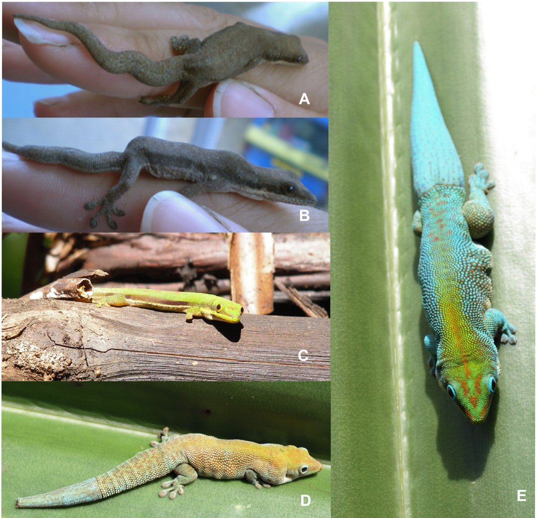
Figure 2. A. Malformed Phelsuma modesta leiogaster in dorsal and (B) lateral view. Note the deformed spinal column with three humps (A) and the “accordion”-like shape of the tail (B). C. Malformed male of P. pusilla pusilla from Andaparaty; D. P. berghofi female and (E) male of P. berghofi from Nosy Omby. Note the extremely swollen left thigh (E).

Phelsuma berghofi was only reported from the Special Reserve of Manombo, approximately 50 km north of the type locality (Rocha et al. 2009; Pearson and Raxworthy 2009; Glaw and Vences 2007). Phelsuma berghofi has rarely been found outside the villages and if found, it was exclusively encountered on traveller’s tree ( Ravenala madagascariensis ). Due to its limited distribution range and the continuing decline in the extent and quality of its habitat in south-eastern Madagascar, Phelsuma berghofi was suggested to be evaluated as endangered (Schneider 2004; Berghof 2005; Hallmann, Krüger and Trautmann 2008). In 2010 we detected Phelsuma berghofi in the area between the villages Vangaindrano (23° 20’ 52”