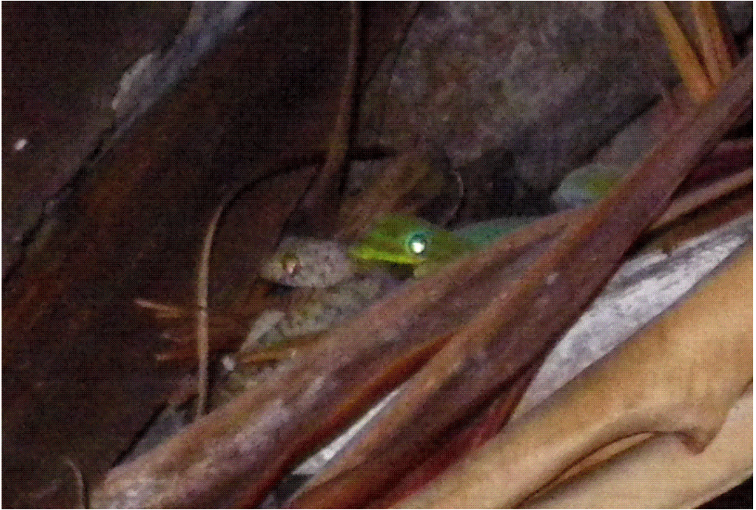
Figure 4. Phelsuma l. laticauda capturing a Hemidactylus specimen in Ankify, northwestern Madagascar.

strong contrast with the green coloration of the back (Fig. 3B). Soon after, the IM showed the same behavior and both opponents lifted alternately their back towards each other while moving slowly in a circle, always keeping a certain distance to each other (Fig. 3C). During the whole fight tail-wriggling occurred and may have indicated the excitement of both opponents. The sideward tilting was interrupted by short breaks in which both males preserved their positions more or less without any movements, always keeping an eye on each other and displaying occasional tongue-flicking. The RM started several fast assaults at the IM during which intensive horizontal trembling of the head and slow movements towards the rival marked the beginning. The IM did not try to avoid the attacks and remained motionless in his position. After several of these attacks, the RM slowly approached its opponent, accompanied by intensive tongue-flicking and both rivals remained motionless sitting side by side for several minutes (Fig. 3D). After a last fast attack of the RM which was accompanied by a squeezing short noise, the IM left the banana leaf and disappeared inside the banana plant.