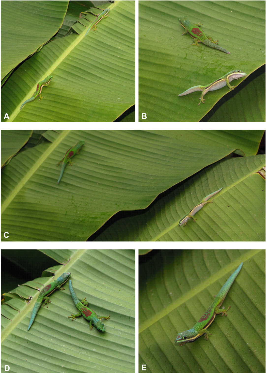
Figure 3. Rival fight of two P. l. lineata males on a banana plant in Anosibe An'Ala. A. Introduced male (IM) curving its body in a s-shape; B. sideward threat with a lifted back; C. both rivals showing sideward threat with a lifted back; D. both males sitting motionless side by side; E. resident male (RE) in splendid coloration, note the blue spots on the head, neck and tail.